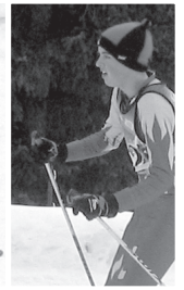
CHS Nordic Meet 2008

the culture of the HS team is very positive and supportive, the coaching resources are limited. The physical demands are adjusted for the age group.